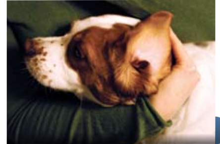
Use one hand to hold the ear flap back so that you can treat the ear with the other.